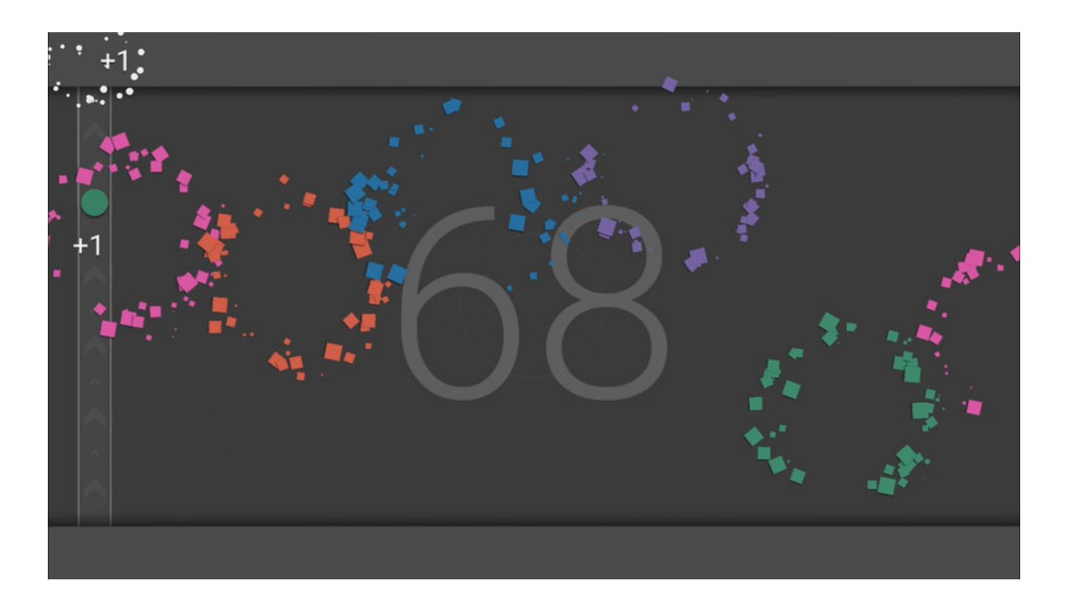
Toxic Terror Download For Pc [key]

Download ->>->> <a href="http://bit.ly/2SMdws7">http://bit.ly/2SMdws7</a>